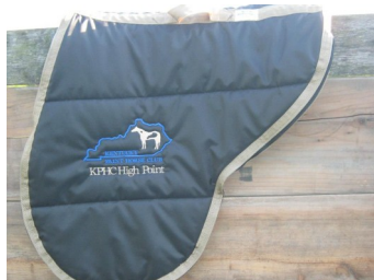
One of the great high point awards given out to high point winners at the October Paint O Rama.